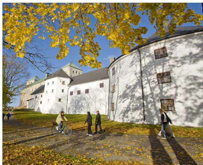
Autum colors at the Castle of Turku park on October.