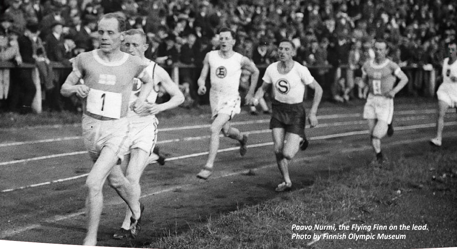
Paavo Nurmi, the Flying Finn on the lead.