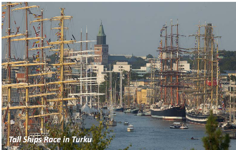
Tall Ships Race in Turku

Because of its long history, Turku has been the site of many important events, and it has extensively influenced Finnish history. The history of the country is closely linked to Turku, the former capital.