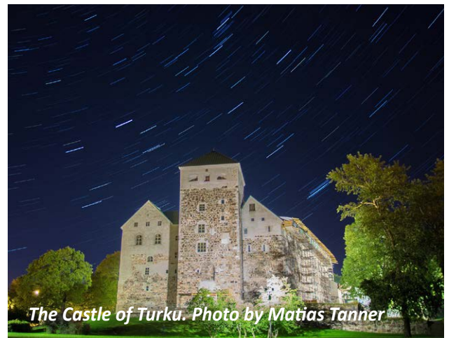
The Castle of Turku.