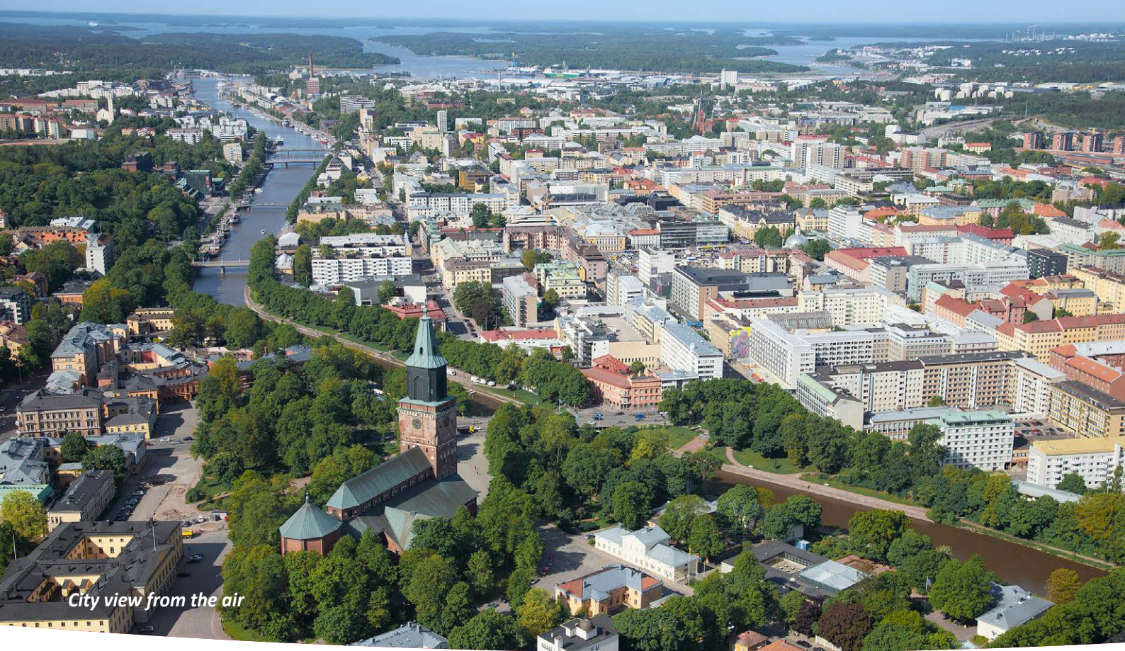
City view from the air